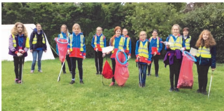
Girl Guides and the regular team keeping Bookham tidy