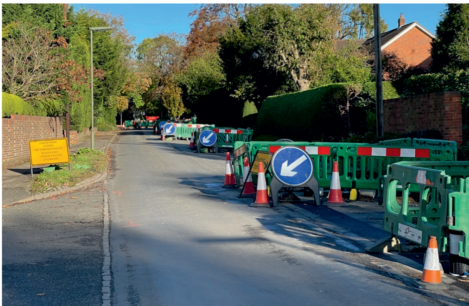
Water main works continue on the Lower Road.

Information about current and planned roadworks can be found on the Surrey roadworks map: www.surreycc.gov.uk/roads-and-transport/roadworks-and-maintenance/roadworks